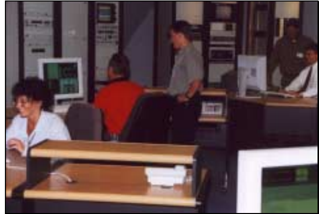
The SLC-20 launch center requires only four launch controllers using highly automated multi-mission technology provided by CCT.

mechanism for analyzing actual vehicle performance verses planned performance.